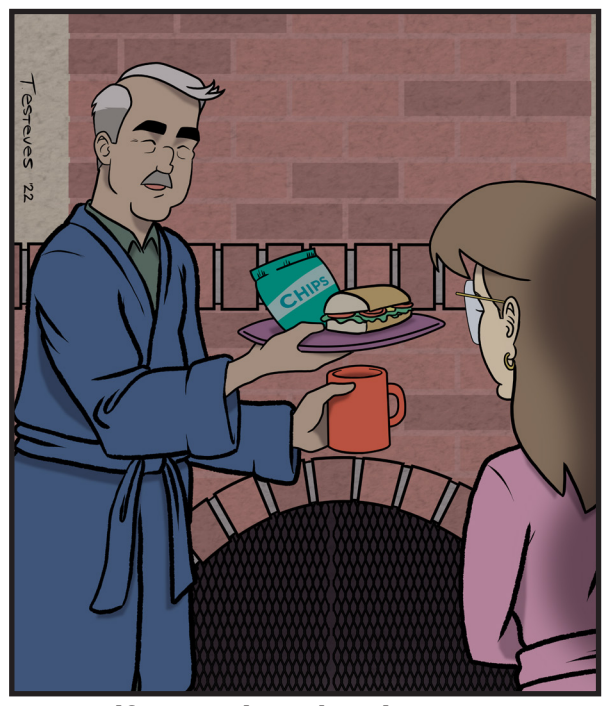
Even if Santa isn't leaving presents, he might enjoy a late-night snack.

During the holiday season, the ARTA office will be closing at 2 p.m. on Friday, December 23, and will reopen on Tuesday, January 3. If you need assistance with your membership or benefits during this time, a reduced staff will still be available to answer emails and phone calls from members on December 28, 29, and 30.